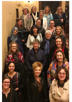
Women of PMPA enjoy each other's company at dinner.